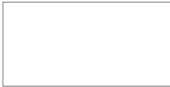
White 452-P (LRV-90)