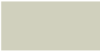
Quartz 455-P (LRV-67)