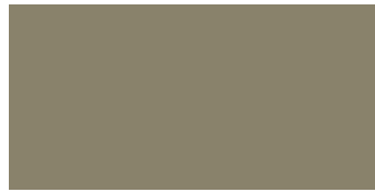
Stone 251-T (LRV-39)