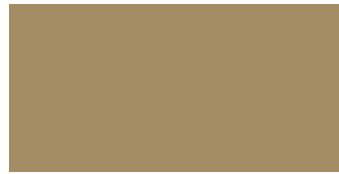
Brick Buff 99-T (LRV-39)