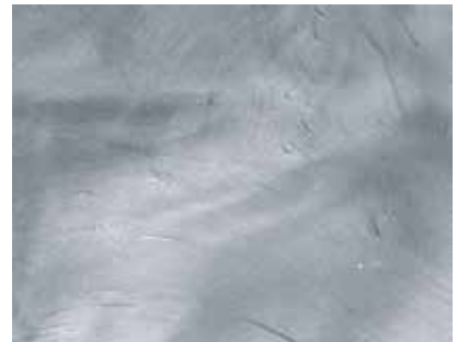
Silver | 661