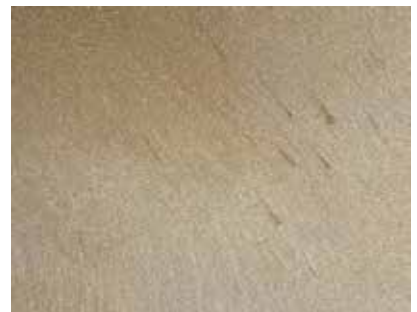
Taupe | 670