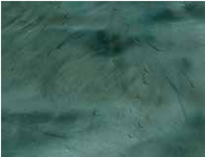
Marine | 655