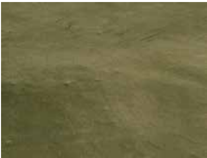
Jade | 656