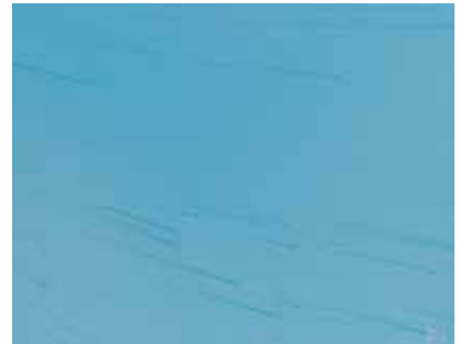
Topaz | 671