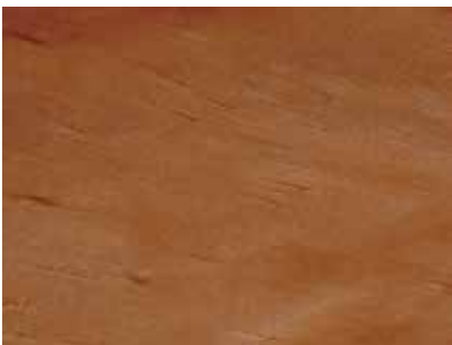
Sunset | 657