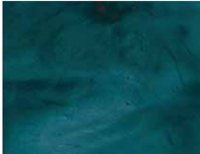
Sapphire | 662