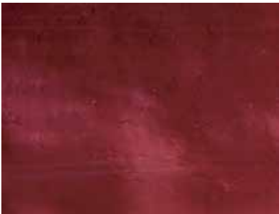
Ruby | 660