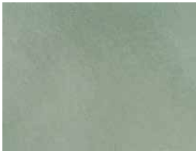
Sage | 669