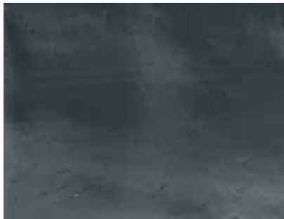
Graphite | 663