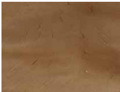
Café | 658