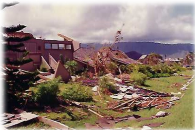
A Princeville area after Iniki

Wai`oli Hui`ia Church has stood the test of time. The original Mission was established in 1834 in the heart of Hanalei and its “Little Green Church” was built in 1912. It is listed on the National Registry of Historic Buildings and has become a world-famous house of worship.