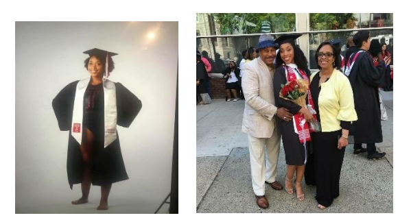
June 7, 2018:

.....you are more than a title or position. Be a positive...love first....service to others... and inclusive generation of doers. Their lives...body of work and examples they set will permeate and resonate in our world. It was a beautiful and fulfilling day.