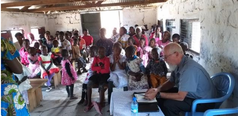
Masai Church Service.

Hebrews 6:10, "For God is not unrighteous to forget your work and labour of love, which you showed towards his name, in that ye have ministered to the saints and do minister."