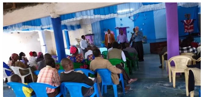
Seminar with Pastors and Leaders.