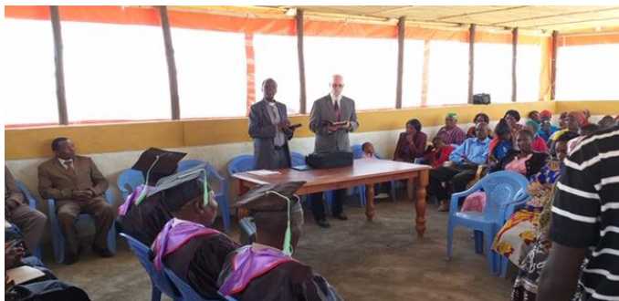
Bible School Graduation Service.