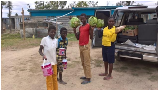
Children at the home.