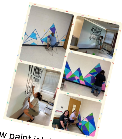
New paint job in the Sunday School Room! It's awesome!