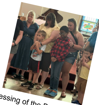
Blessing of the Backpacks