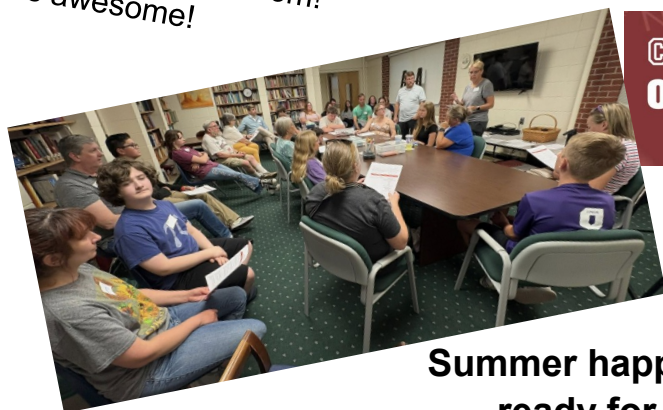
Summer happenings and getting ready for fall programming