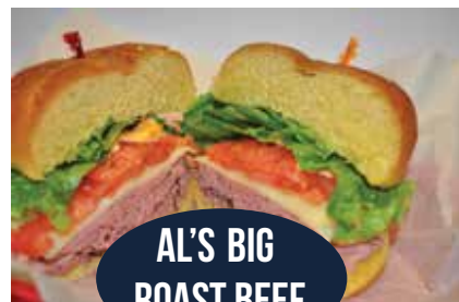
AL'S BIG ROAST BEEF

Al's Big Roast Beef - $11.99 Thinly sliced rare roast beef, Swiss cheese, lettuce and tomato served on a kaiser roll with Russian dressing