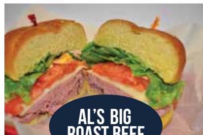
AL'S BIG ROAST BEEF