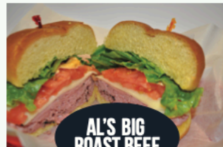
AL'S BIG ROAST BEEF

Solid white albacore tuna salad, lettuce and tomato served on toasted honey wheat bread