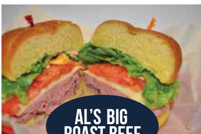
AL'S BIG ROAST BEEF

Tuna Salad - $8.49 Solid white albacore tuna salad, lettuce and tomato served on toasted honey wheat bread