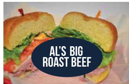
AL'S BIG ROAST BEEF

Al's Big Roast Beef - $10.79 Thinly sliced rare roast beef, Swiss cheese, lettuce and tomato served on a kaiser roll with Russian dressing