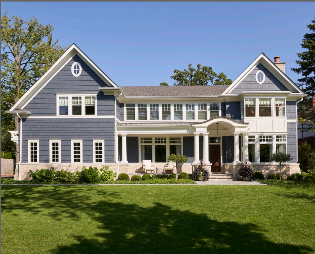
Residence designed by: En Masse Architecture and Design

Benefiting the Community House in Winnetka