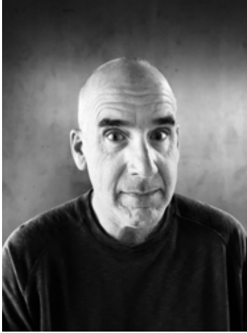
MICHAEL ABRAHAM ARCHITECTURE