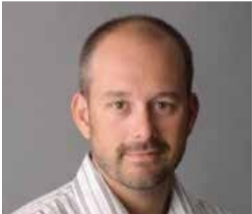
HUFF GROUP NORTH SHORE CHICAGO