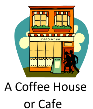
Page 9 of 22