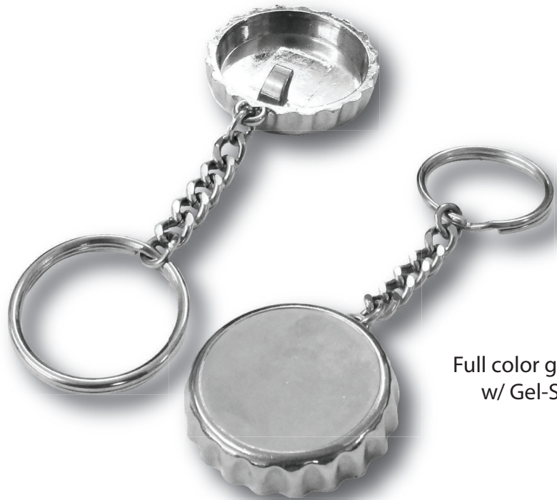
Full color graphic w/ Gel-Skin

Please send files without our colored guidelines. All text should be converted to outline.