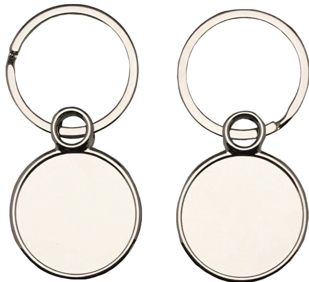
Front - Full color graphic w/ Gel-Skin

Please send files without our colored guidelines. All text should be converted to outline.