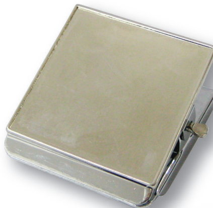
Full color graphic w/ Gel-Skin

Please send files without our colored guidelines. All text should be converted to outline.