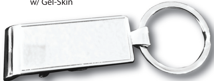
Front - Full color graphic w/ Gel-Skin

IMPORTANT Please send files without our colored guidelines. All text should be converted to outline.