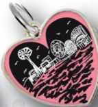
Heart - BJHT - Dimension - 20mm x 21m