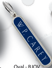
Oval - BJOV - Dimension - 5mm x 34mm