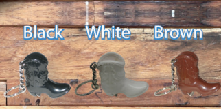
Black White Brown