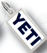
Lg Rect - BJLR - Dimension - 11mm x 25mm