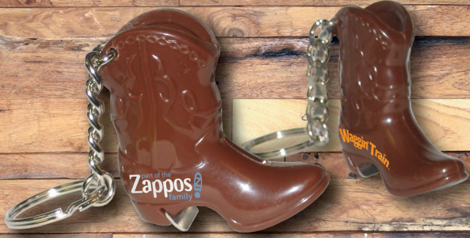
Bottle Opener Under Boot