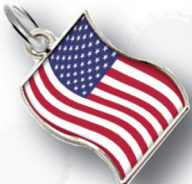
Flag - BJFL - Dimension - 23mm x 19mm