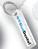
Sm Rect - BJSR - Dimension - 5mm x 23mm

All Bijous come with full color graphics and Gel-Skin coating, on chrome bijou