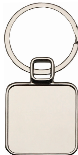
Back - Full color graphic w/ Gel-Skin