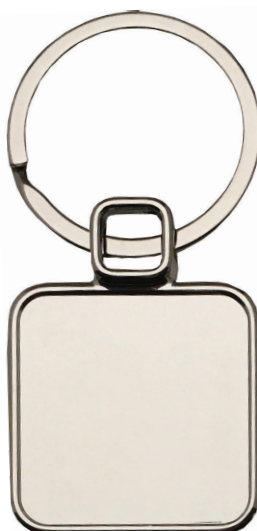
Front - Full color graphic w/ Gel-Skin

Please send files without our colored guidelines. All text should be converted to outline.