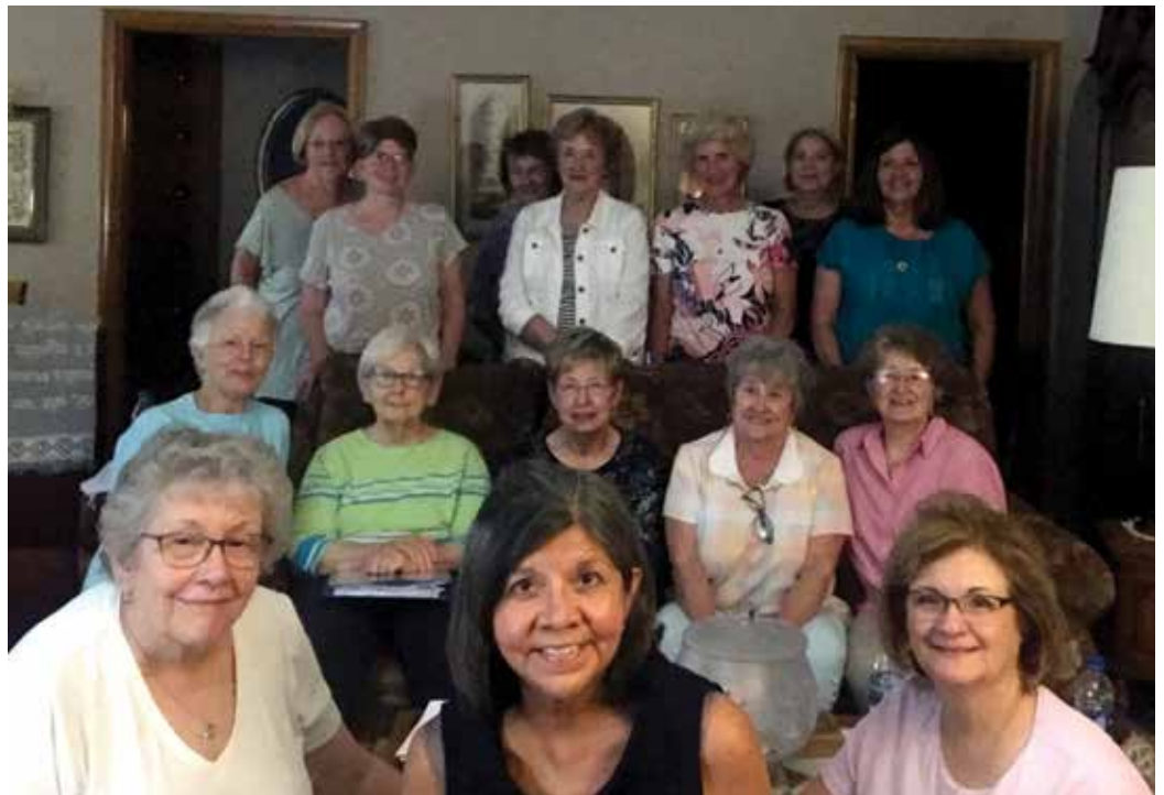
The Women's Prayer Group members gather for a recent session.