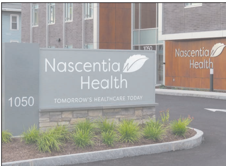
Nascentia Health on Sept. 19 formally opened its new headquarters at 1050 W. Genesee St. in Syracuse. Nascentia Health is the rebranded name of VNA Homecare, VNA Homecare Options, Home Aides of Central New York, and their respective affiliated organizations and foundations. They moved into the building in early 2018.

Syracuse was the general contractor on the project. Syracuse-based King + King Architects designed the structure. Rolf also noted the contributions of Sedgwick Business Interiors for furniture design and products, along with Signage Systems of the town of Onondaga.