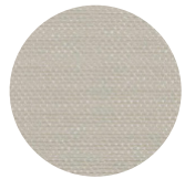
Macadamia Silvertex 122-0001