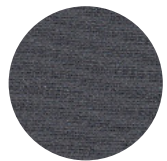
Carbon Silvertex 122-9002