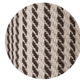
Summer Ebano Dedar Outdoor