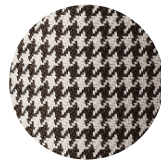
Pool Ebano Dedar Outdoor