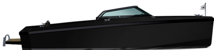
Black Edition (Coloured hull and innerliner)