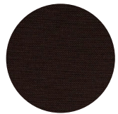
Mocca Silvertex 122-0005