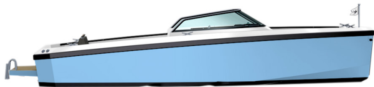
Gulf Blue H016