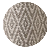
Basquette Beige Dedar Outdoor