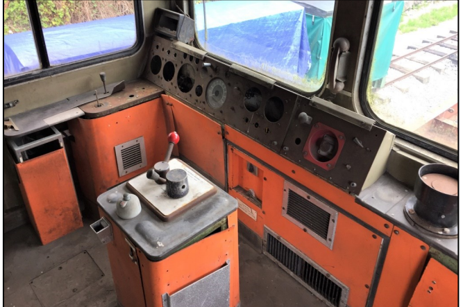
The number 1 end cab with its panelling complete and waiting to be fitted

After a good clean and tidy though, we found that we had enough bits of cab trim to complete one end, and between the two cabs we had almost a full set of gauges lamps and switches.