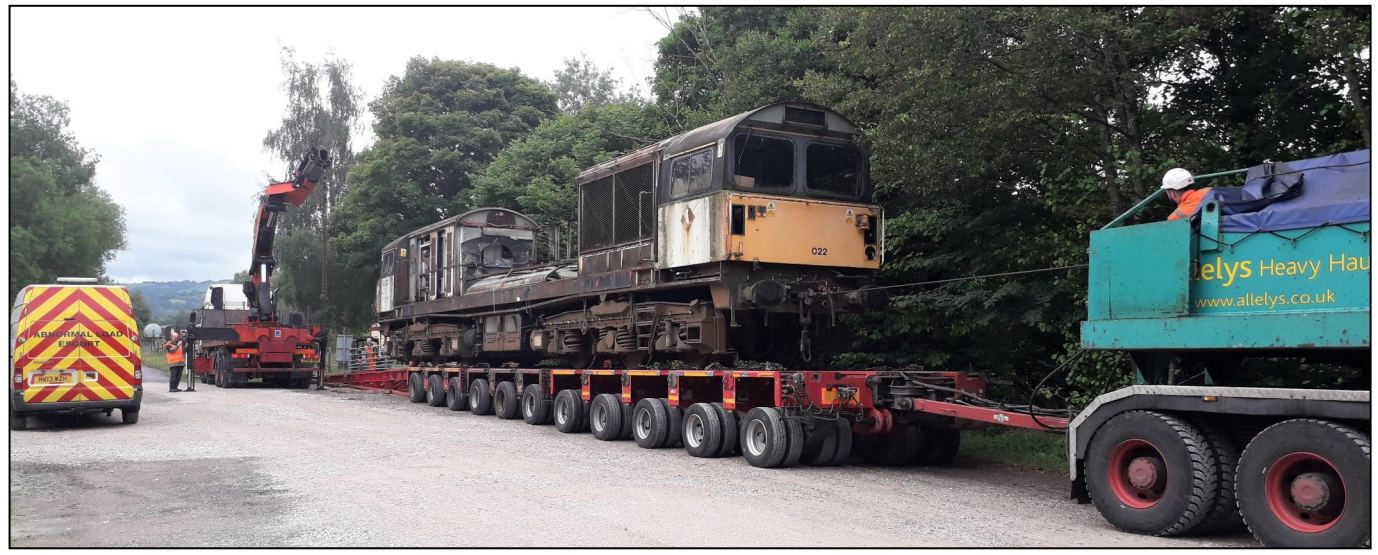
58022 inching its way onto the Alleleys trailer.

After moving our 16SVT engine to Wirksworth earlier in the year, and removing the engine from 58022 a few weeks previously, on 18th August, the day finally came to move 58022 out of Rowsley South yard.