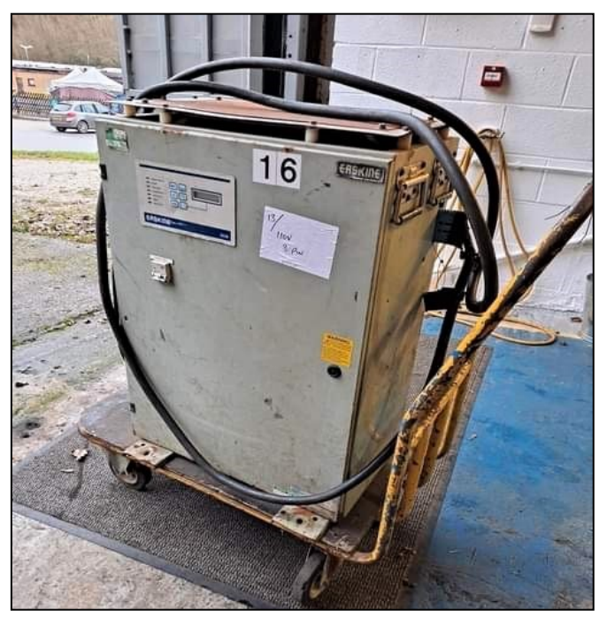
Left: one of the Mk3 brake distributors that we swapped for the battery charger. Right: the spare battery charger for our sleeper coach.

Back to the point.... Also on the pallet were a couple of mystery items I didn't recognise, but I soon found out were antifreeze atomisers. These are part of the braking system, and, as the name suggests, they stop things from freezing up in cold weather. These will be really useful in keeping us running through the winter. I've heard tell of a temperature of minus 17 being recorded at Wirksworth! I would have liked to show a picture of one of them all cleaned up and painted, but the pandemic put paid to that idea. Never mind, another tiny piece is in the jigsaw. Onwards and upwards!