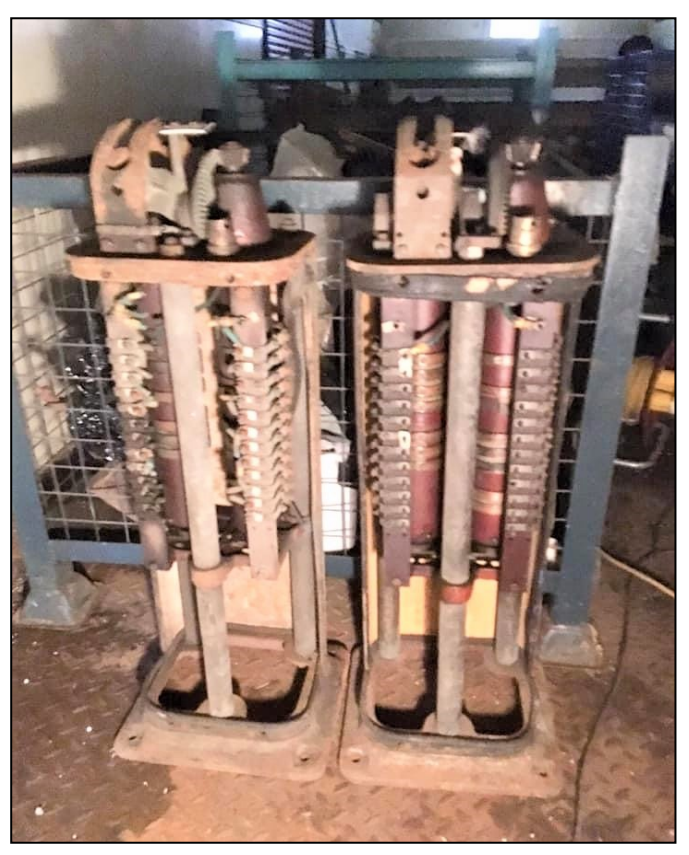
Two very rare items - control pedestals from a class 31/0 locomotive, These will be refurbished and modified for reuse on 10000. The mechanisms on the top will be removed and replaced with items identical to those on 10000/1.