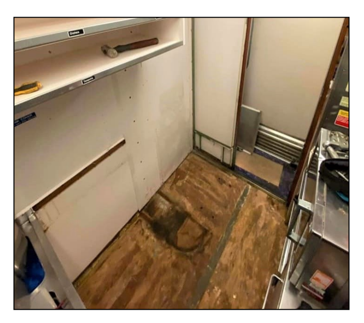
The old flooring has been removed and some cupboards taken out to make space for the water heater.

When the pandemic restrictions are reduced sufficiently for us to restart properly at Centenary Works, the coach will be available for use for any of our volunteers who need it. There will be a charge of £7.50 per compartment per night, which will help to cover the cost of