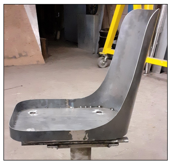
This version of the seat is a mock-up to check that all the angles and dimensions are correct before remanufacturing in thicker steel sheet.

One of our volunteers, Phil Stanbridge, works at TAS Engineering in Burton, and offered to have a go at building new seats to fit on the original seat bases. This sounds easy, but there are no drawings of the cab seats, and almost no photos. Armed with what little information we had, Phil set about making a prototype from thin gauge sheet, which is easier to work with, to see what it would look like. After a few minor adjustments, the design was approved, and TAS set about making the seats in steel thick enough to