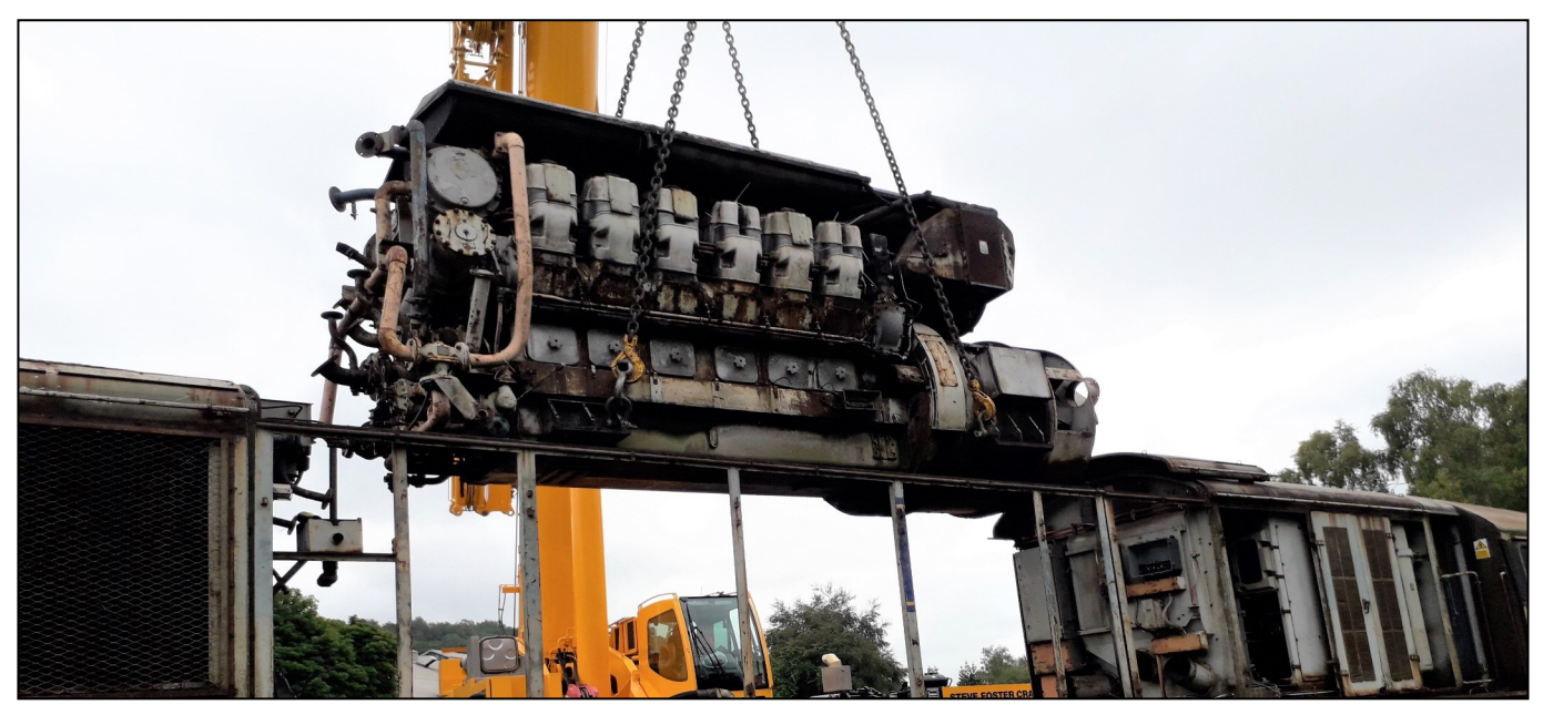
After some last minute difficulty with a stubborn engine mount, the power unit is finally free of the loco.

Saturday morning and the usual rule regarding the best laid plans ensured we were waiting for our crane to turn up, as they had been given the wrong arrival time. We decided to make use of the time though, and everything was triplechecked to ensure we had done our job right. If you have ever hired a large crane, you will understand that it is an expensive and potentially risky business, so we wanted nothing left to chance.