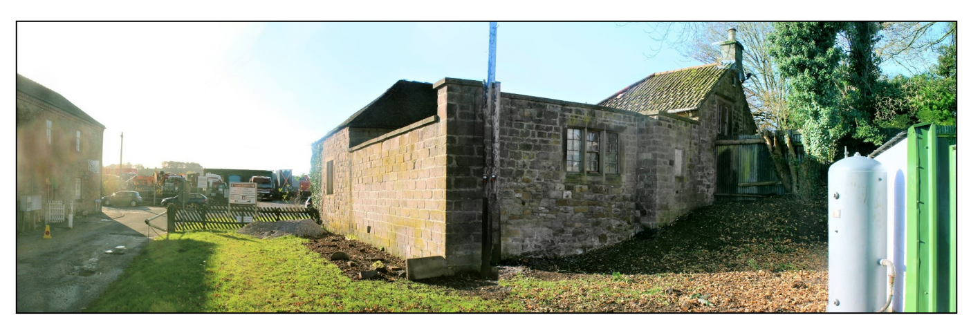
The garden area at the back of the shed after clearing out many years of rubbish and cutting back the undergrowth.

garden. They have planned out which plants will go where, to make sure that there is something to look at all year round. They have already planted some shrubs that will be able to survive the winter, and will be back in the spring to plant the rest of the display. We would like to thank Philippa and the team from the U3A group, who have done a great job for us.