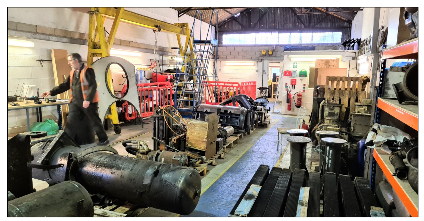
A large number of items are now accumulating in the workshop. The first job when the lockdown is over will be a serious tidy up!

Over the last few months, despite the current restrictions, we have managed to achieve some notable goals. Below is a quick summary of what we have been up to, and what we plan to do next.