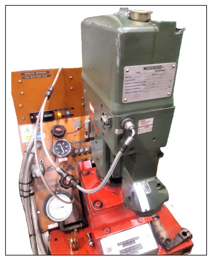
The governor being tested.

During the design study we looked at replicating a design previously used by the Autocar Trust. However, during discussions with the Trust they very kindly offered us the free use of their bar track - all we had to do was find it! With an offer as good as that, and the significant potential cost saving, efforts were made to 'track it down' (pardon the pun). The tricky bit was that the haulier who last used the bar track had gone into receivership, and the bar track was nowhere to be seen. After considerable further investigation, and much negotiation, we discovered its current location, and have secured the use of the track, with many thanks to all involved and to the Autocar Trust for facilitating this great result.