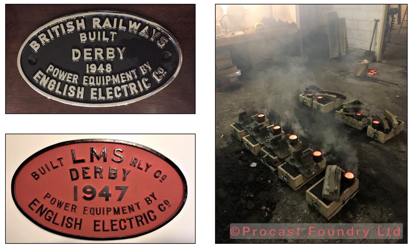
A batch of works plates being cast at Procast, one of the patterns, and the finished product.

A little while ago, we had a batch of replica 10000 works plates produced, which turned out to be quite popular. They were produced by Procast, who as always did an excellent job. The plates are cast in brass, polished, chrome-plated and polished again before being painted.