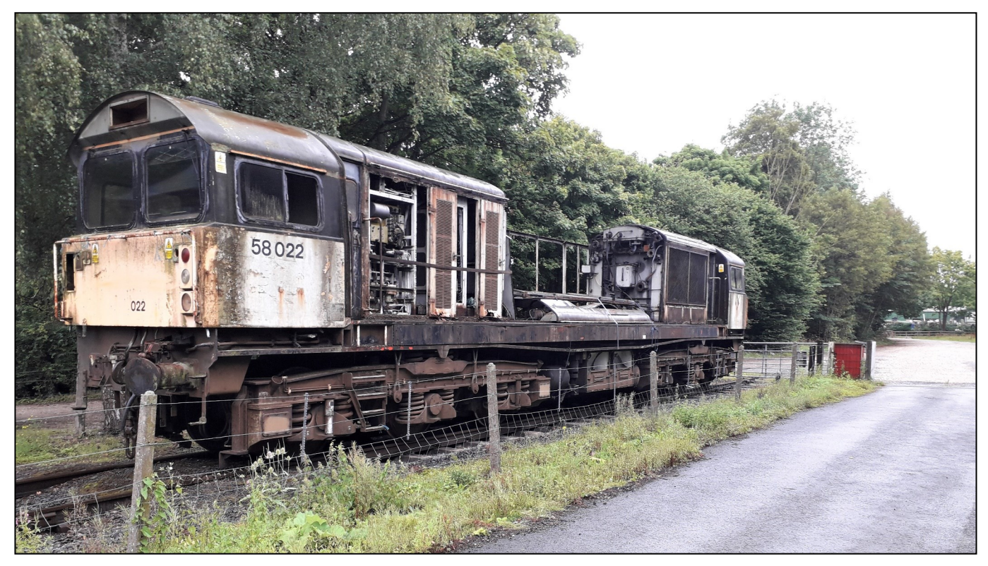
58022, minus its power unit, awaiting the arrival of the Allelys trailer.