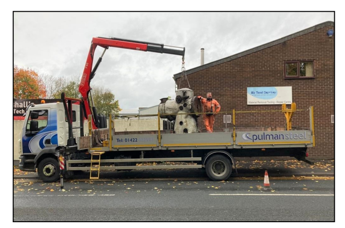
Our thanks to Pulman Steel, who assisted with the loading and transport of the boiler.

A small team of volunteers to work on the boiler is being formed, some of whom have experience working on loco boilers in the past. If you would like to get involved with the boiler restoration, please email us at info@Ims10000.co.uk, and hopefully before we are too far into 2021, we will be able to make a start on this exciting project.