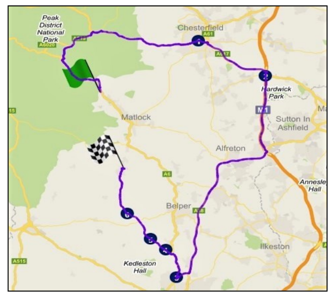
The circuitous route we had to take to avoid weight restrictions stipulated by Network Rail and the Local Council.

We arrived at Peak Rail at around 08:00, to find they had moved the 58 to the end of the headshunt, apparently using one of their steam locos. Allelys arrived around 9:30 to load the loco onto their trailer. If you ever get a chance to see them load a loco, take it – they do an excellent and professional job.