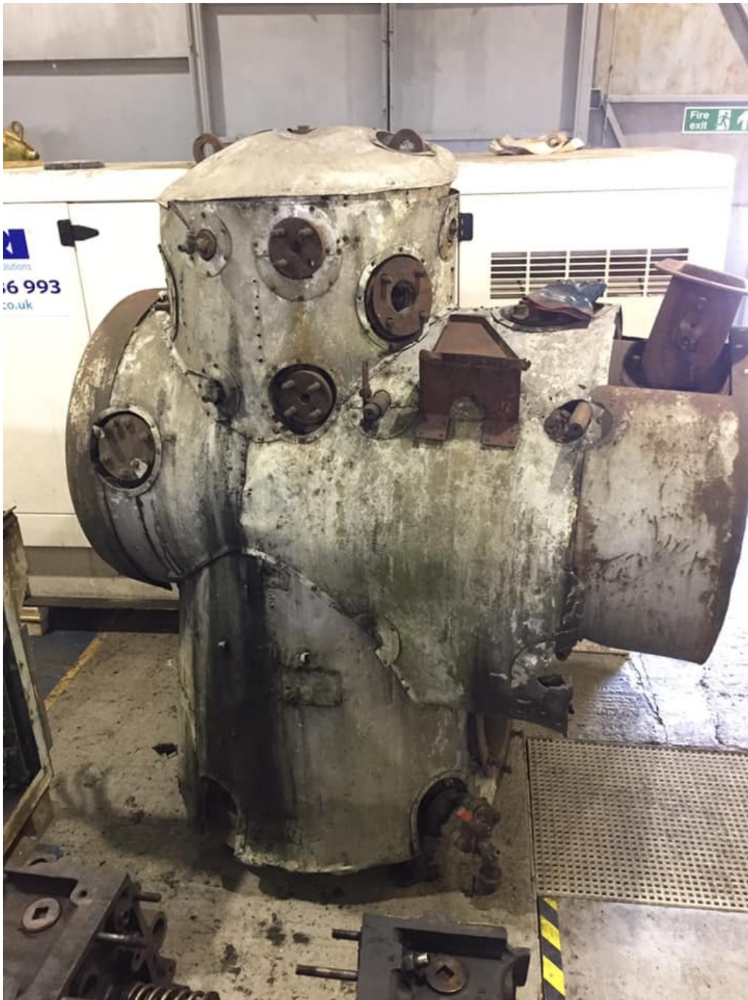
This is the boiler from 55009. It was our second choice boiler shell, and was purchased as a spare when we realised how many parts we had received from the DPS.