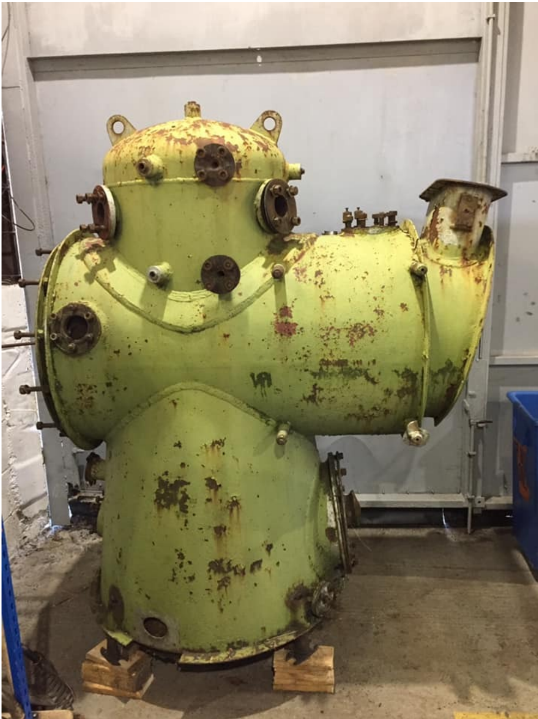
One of our young members, Kieron, cleaning, lubricating and removing nuts and studs from one of our steam heat boilers at the workshop today.