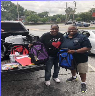
U-First, Atlanta, GA