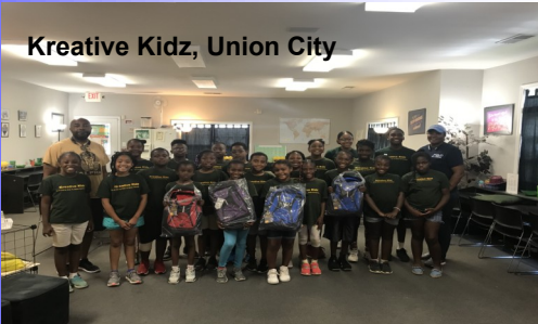
Kreative Kidz, Union City