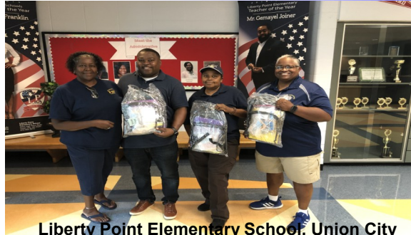
Liberty Point Elementary School, Union City