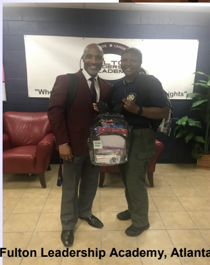
Fulton Leadership Academy, Atlanta