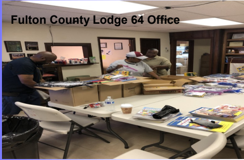
Fulton County Lodge 64 Office