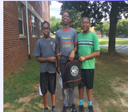
Mt. Vernon Baptist Church, Atlanta