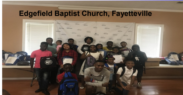
Edgefield Baptist Church, Fayetteville