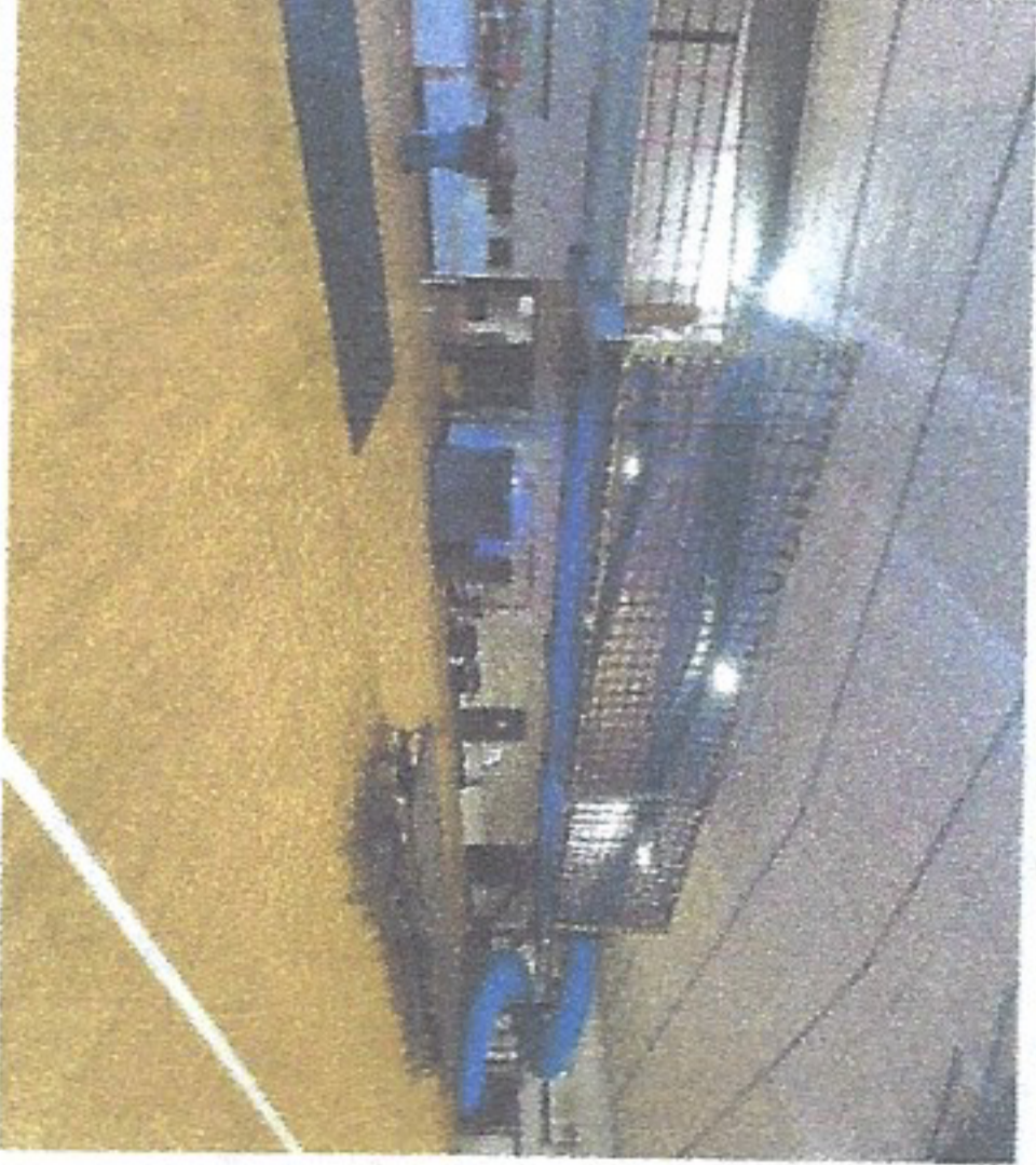
Gymnasium with tube slide and rope play area.

dates will be posted on our Facebook page, and through local newspapers, including the Preston County Journal and the Dominion Post. Radio announcements will be broadcast from WFSP 1560 AM/107.7 FM (Kingwood) and WAJR 1440 AM/104.5 FM (Morgantown).