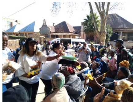
Mandela Day #Outreach Program 2023