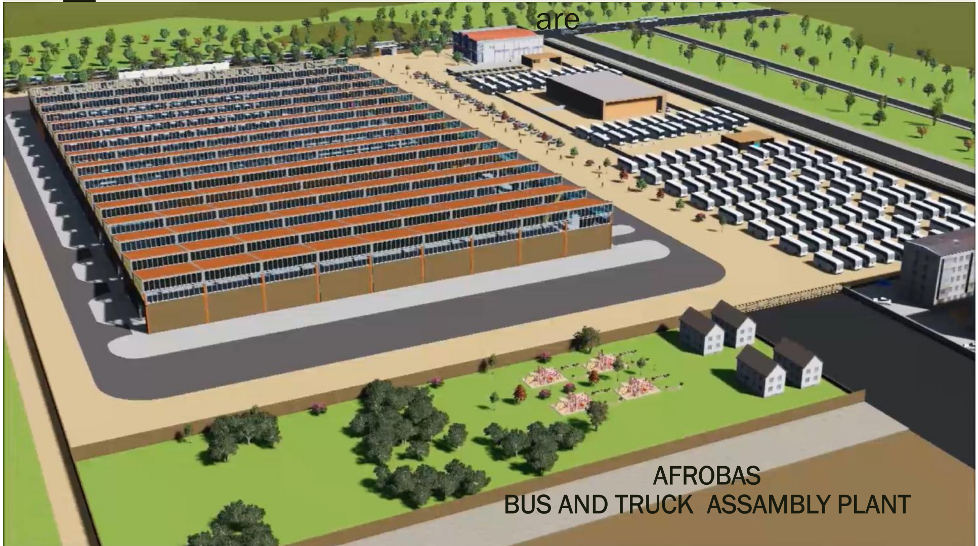
AFROBAS BUS AND TRUCK ASSAMBLY PLANT