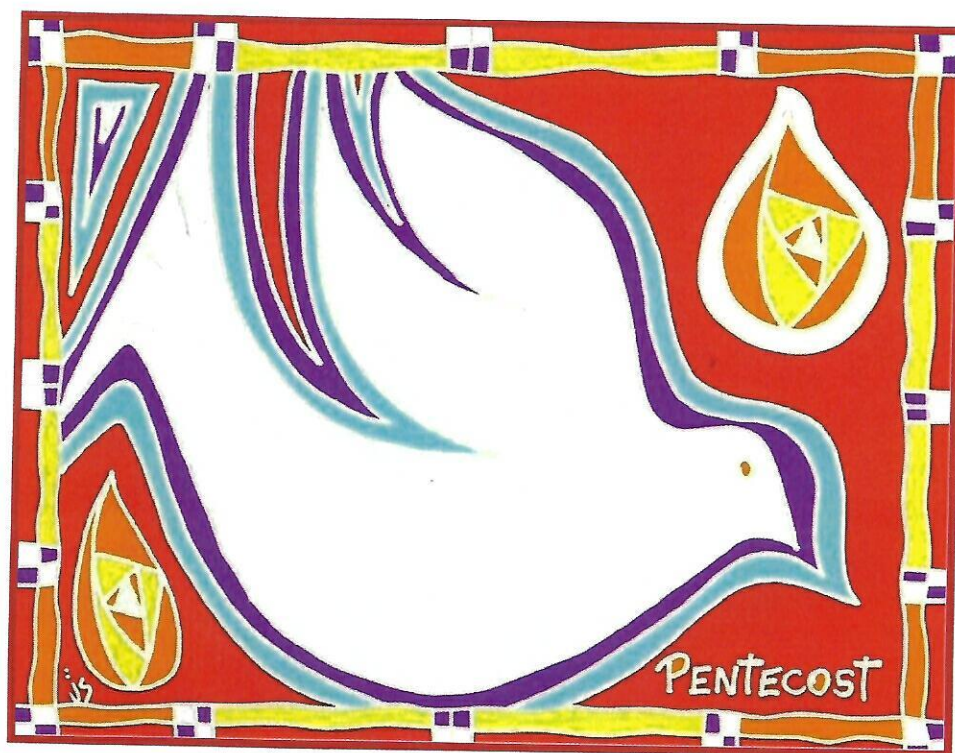
Artwork by Stushie Art