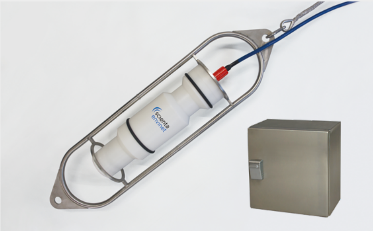
Spectroscopic Gamma Detector TUNA with base station