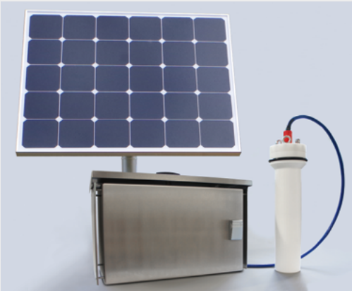
TUNA fixed base station for fully autonomous operation using solar, battery and LTE.