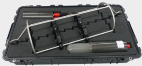
Accessories: Mobile base station, transporting solutions for standard- and deep-sea detectors, test- and verification equipment