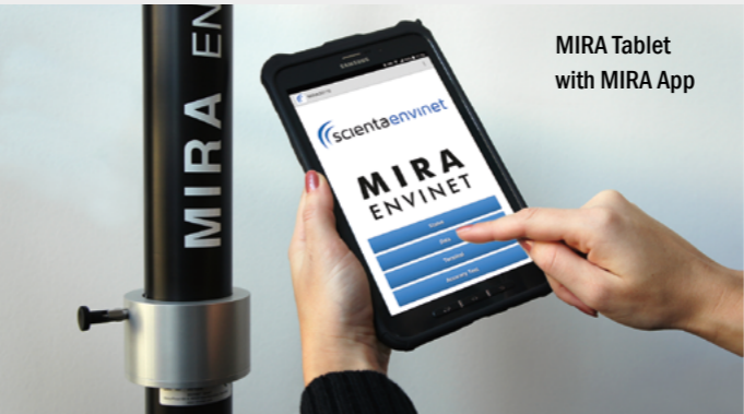
MIRA Tablet with MIRA App