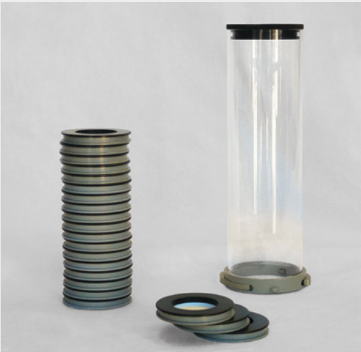
Filters and filter magazine