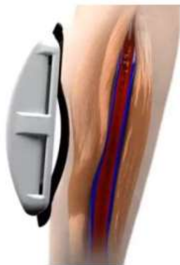
How the Circulation Booster works