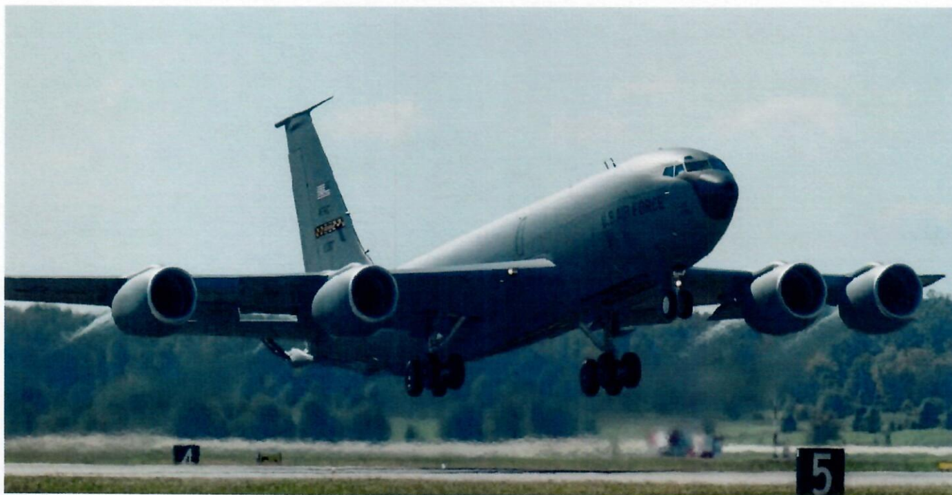
A KC-135 Stratotanker takes off during Exercise “Kitty Claw”, a scaled down version of the wing’s “Tiger Claw” exercise, Oct. 17, 2021, at Joint Base Andrews, Md. The wing scaled down the exercise to allow for the wing to comply with the COVID-19 mandate.

“I didn’t do it for the medals,” he said. “The position I filled was great. Knowing I did my job, and to be in that environment where I was able to build those relationships with my commander and my Airmen was all the fulfillment I needed. At the end of the day the medals are extra, but I am humbled and appreciative of the awards I received.”