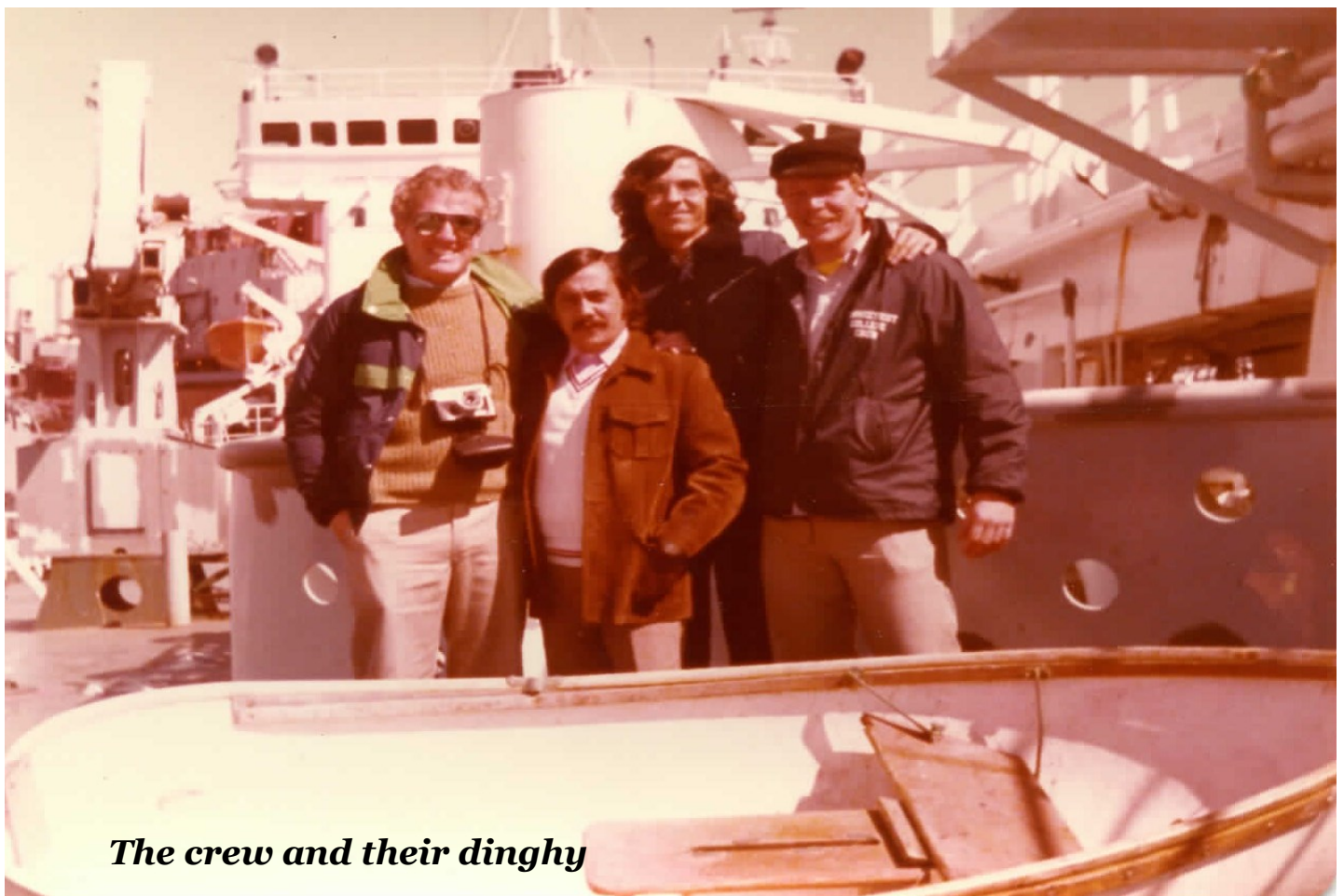
The crew and their dinghy