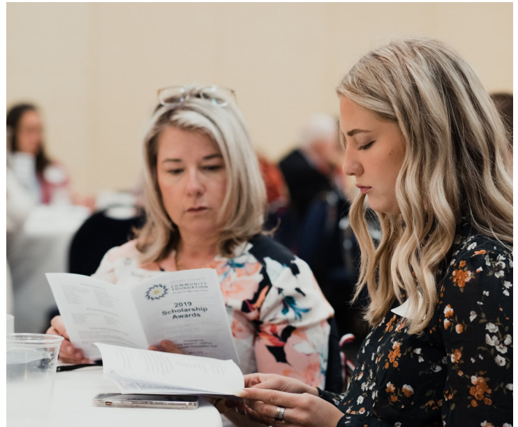
Meeting of donors, scholars and parents

Donors were inspired to boost future scholarship grants to a level where they enable students who may not otherwise pursue higher education.