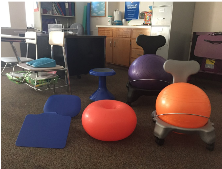
Alternative seating for students

Some students are unable to sit still due to ADD, ADHD and other conditions. Classrooms serving local day students at Hoffman Homes were equipped with alternative seating.