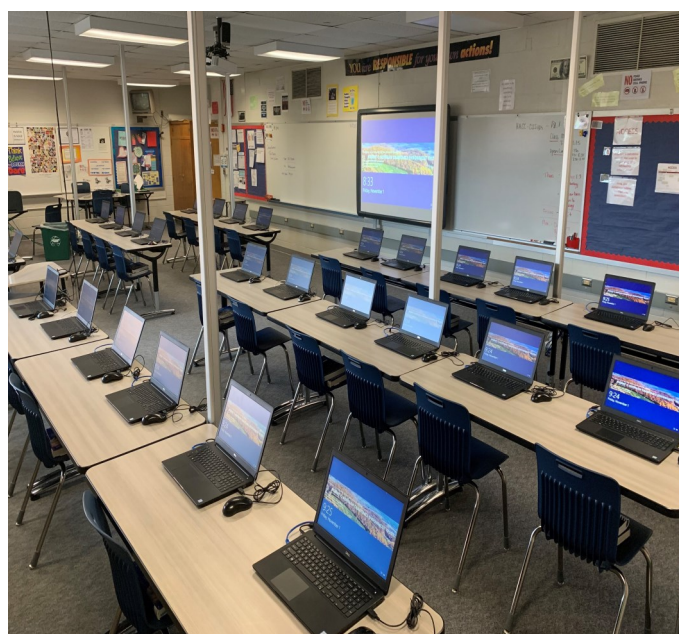
Upgraded technology in New Oxford High School

To ensure that high school students are prepared for the business world they must have hands-on experience with state-of-the-art technology. One of the two New Oxford HS Business Department computer labs was updated with PC based computers, thanks to a grant from the Trust. These are used in daily instruction for Accounting I and II, the Personal Finance courses, and the Introduction to Software For Business course offered through HACC. Students use the laptops in operation of the school store, gaining practical experience in promotions, commercials, creating and managing the store website, managing the inventory and maintaining accounting records.