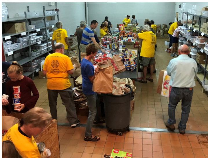
Volunteers sort items for student backpacks

245 of the students eligible for free and reduced school lunch at Gettysburg Area Middle School, Lincoln Elementary and James Gettys Elementary take home a backpack on Fridays. Volunteers have filled the packs with healthy meals and snacks. More than half of the students in these schools are at risk of going hungry.