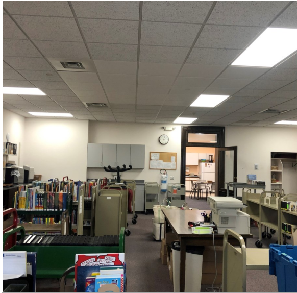
LED lighting brightens Gettysburg Library

Since installing LED lighting in the Gettysburg Library's 3rd floor, garage, and stairwell, the electric bill has significantly decreased. The system has a battery back up in case of power outages, which is not only convenient, but increases safety. Library patrons, staff and volunteers noted the improved light quality immediately, and are grateful for the elimination of the high pitched hum created by the fluorescent lighting. Senior citizen volunteers find it easier to sort books in the garage, since the new lighting is unaffected by fluctuating temperatures.