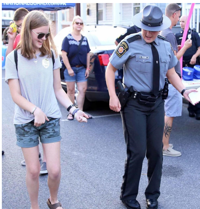
Building community at Olde Getty Place

Olde Getty Place is a 10-block historic neighborhood in Gettysburg that has been targeted for revitalization. The neighborhood took part in the annual National Night Out promoting police-community partnerships. Residents and first-responders enjoyed arts and crafts, nonprofit and business information booths, giveaways, dancing to the tunes of the DJ, a photo booth, food vendors, and tours of firetrucks and police vehicles.