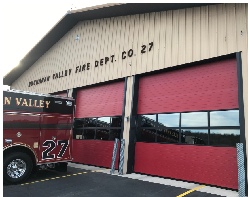
Buchanan Valley Fire Department

The new doors have triple safety features, are dependable, and conserve energy by being insulated and better sealed. Windows in the new doors provide natural light inside, and the Franklin Township community is proud to see the apparatus gleaming inside.