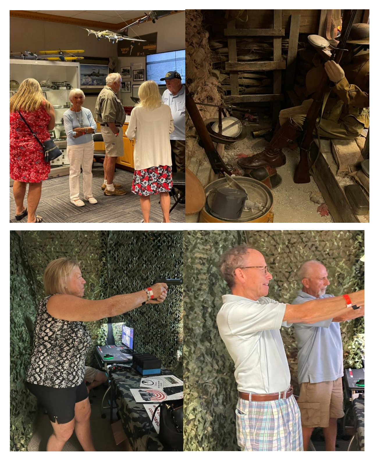
Who knew we had sharp shooters in our midst....