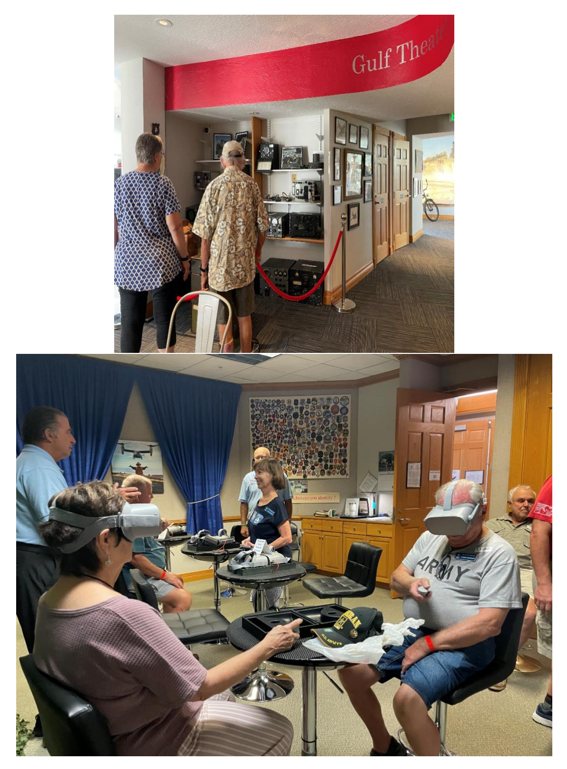
There is so much to see and experience, with the virtual reality mask its like being there!