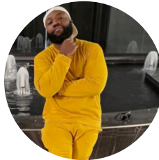
AK OF DO OR DIE