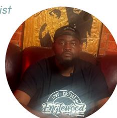
Big Twon Host