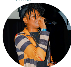
The CAN- Host