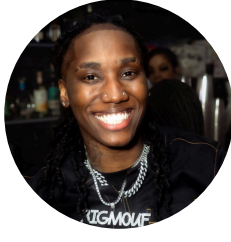
Big Mouf' Bo