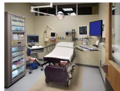
Exam / Procedure Room