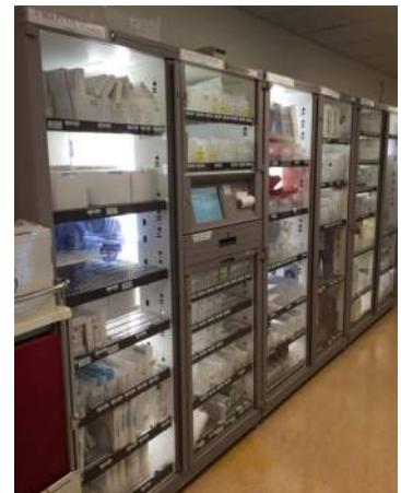
Automated Supply Cabinets

IHP's focused coordination efforts with the contractor and vendors is intended to ensure equipment rough-ins are correct, enabling timely installation of equipment. Depending on the owner's needs, IHP can provide varying levels of procurement support and assistance to ensure they are aware of the tasks for which they are responsible, assist with completion of the tasks necessary to support the procurement schedule, and ultimately the project's construction and start-up schedule.