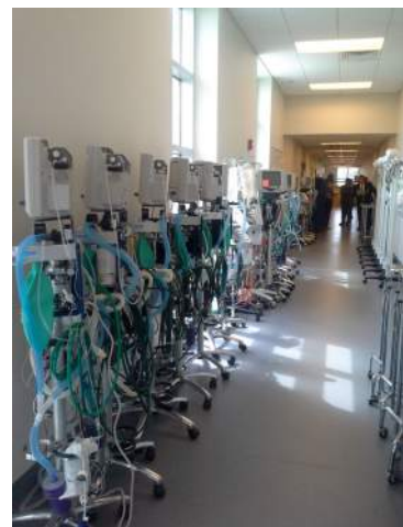
Equipment ready for placement

phone: 615-345-4719 e-mail: info@insight-hp.com website: https://insight-hp.com