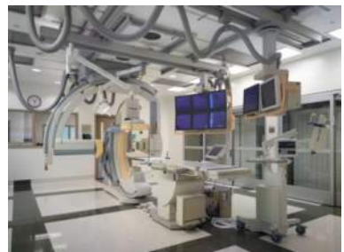
3D Rendering of IR Lab