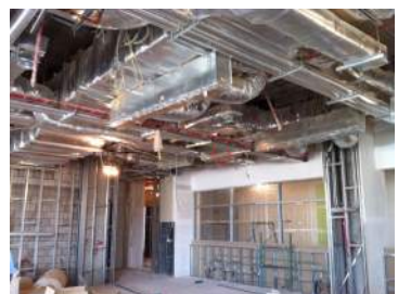
OR during Construction