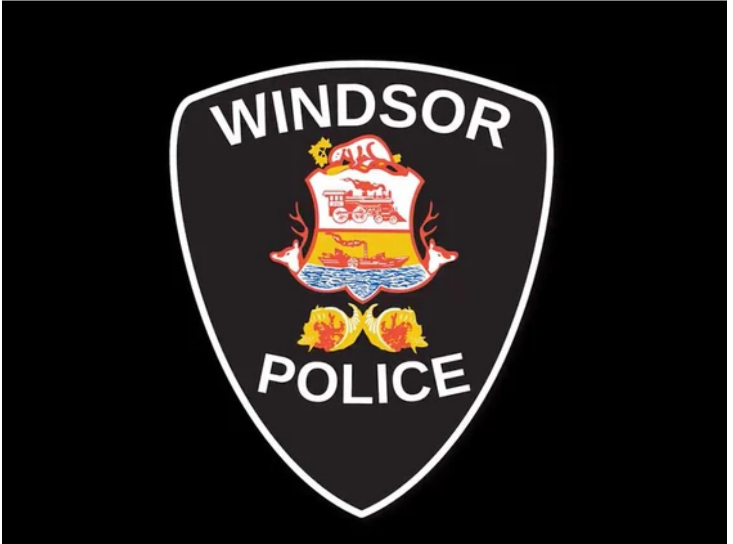
Windsor Police Service insignia, 2019.

A human trafficking victim is safe following a call to police near Windsor’s Jackson Park on Sunday.