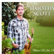
Wanna Tell U Now