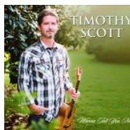
Wanna Tell U Now