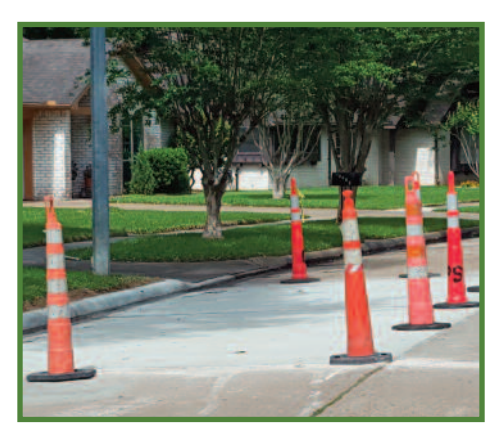
One of our Board members noticed the concrete in this section of the neighborhood a few months ago, called the problem into the city and got results. It looks nice and is much safer now.