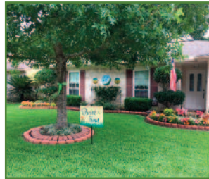
1342 Ashwood Dr.