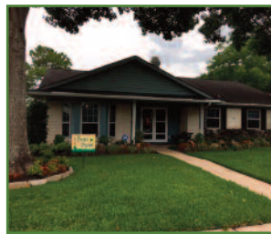
13603 Hampton Ct.