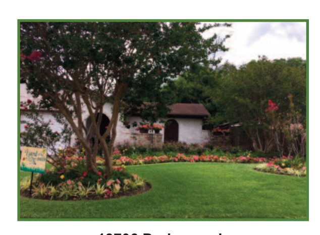
13706 Drakewood Winner of a $50.00 ACE Hardware gift card