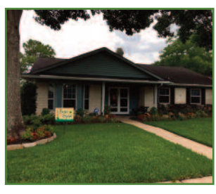
13603 Hampton Ct.