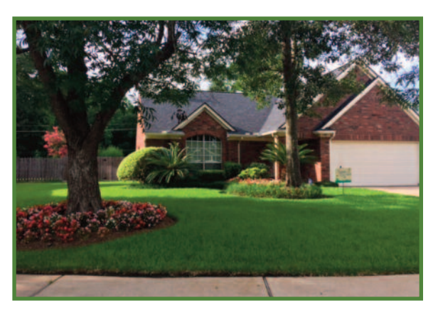
1554 Hitherfield Winner of a $50.00 Home Depot gift card