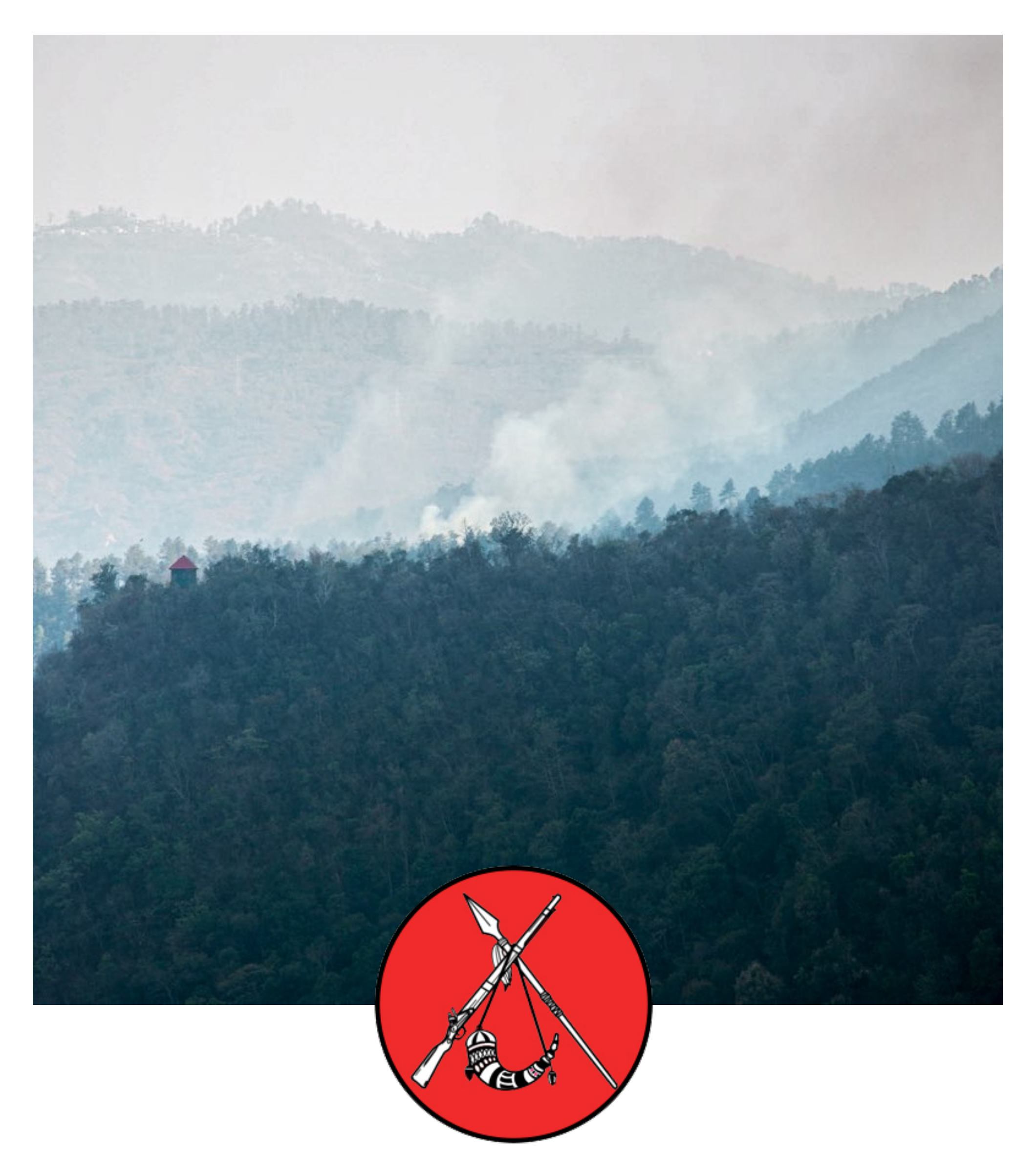
CHIN NATIONAL ARMY CALENDAR 2024