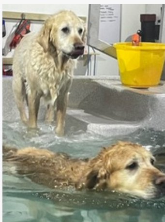
Having a double dog swim with Alfie. Finn has his eye on a ball while Alfie has a rest.