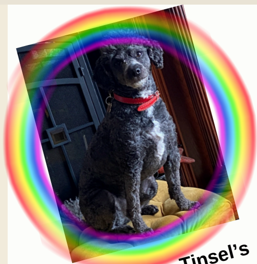
Oreo was Tinsel's "husband" and Orion and Iypad's "dad"

All 3 dogs are my emotional support dogs and they mean a lot to me. Back in April I had to put my beloved Oreo to sleep who was my first emotional support dog.