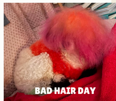
BAD HAIR DAY