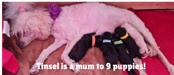
Tinsel is a mum to 9 puppies!

Tinsel just loves to play with a ball and won't let anyone else play with it