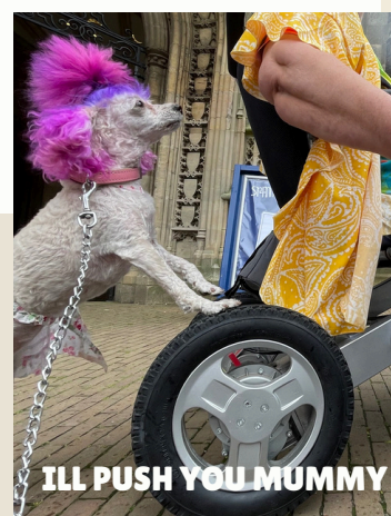
I'LL PUSH YOU MUMMY