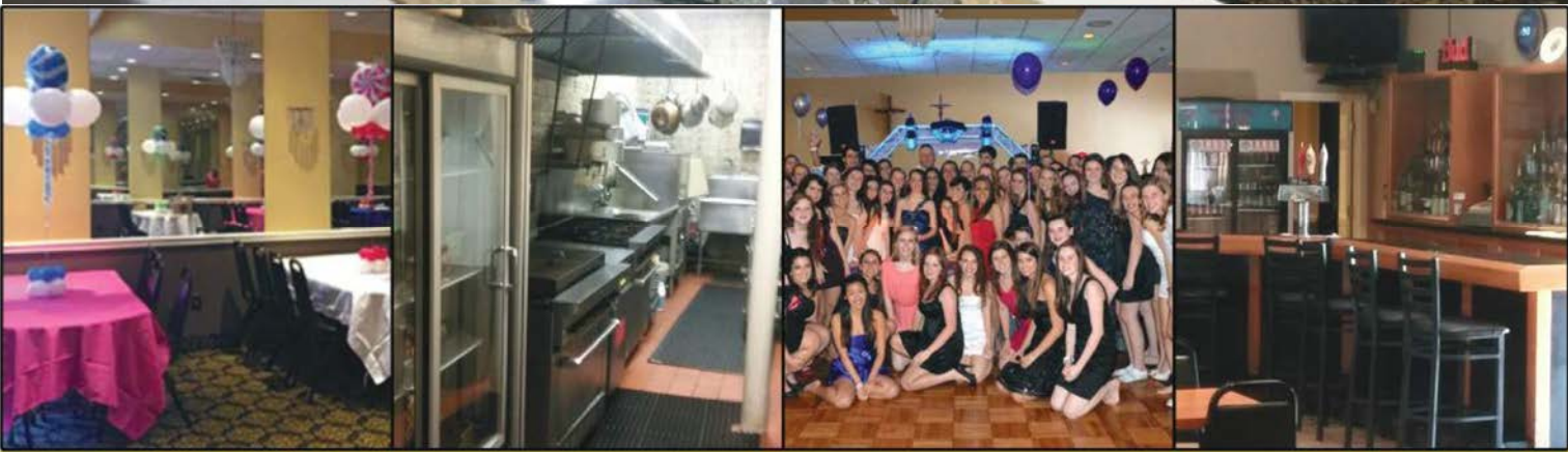
Hewitt Square, East Northport, NY 11731 | www.frjudge.org